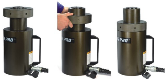
Lock nut feature permits mechanical load holding