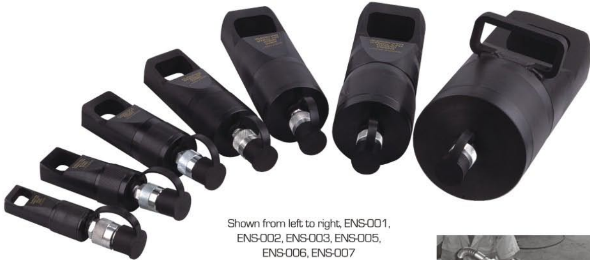
Shown from left to right, ENS-001, ENS-002, ENS-003, ENS-005, ENS-006, ENS-007